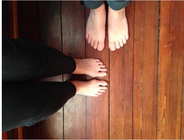
Figure 1. We are inviting the reader to experience some qualities of walking. It is as simple as taking off one's shoes and socks for a while and feeling the environment through one of the primary points of contacts, that is, the feet.

Our second step is closer to a more conventional representation. The following exposition and development of qualities take the form of short vignettes from our own walking experiences (Authors 1 and 2). We focus upon our own experiences of walking and suggest that walking can be seen as a “marginal practice” (Ljungblad & Holmqvist, 2007, p. 737) vis-à-vis the design of mobile technologies. Ljungblad and Holmqvist described marginal practices as practices wherein individuals share a specific activity that they find meaningful. Participants in such a practice have interests or needs that are particular, but their underlying motivations could be applicable also for a more general group of people. Thus, its practitioners are not regarded as end users but are involved to provide underlying human interests and qualities of interaction relevant for the design outcome.