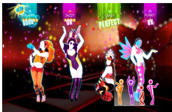
Figure 8. Just Dance, a Kinect-based dance game, requires the player to imitate the moves of an on-screen avatar.

Yamove! players (6 out of 10 pairs) would take up the suggested move, but some would then give it a twist (4 out of 6 pairs). For example, the dance model might call out Swim! and show the players a breast stroke, but the pair would end up doing the crawl stroke together instead. As the round proceeded, half of the pairs danced moves not suggested by the dance model. At this point their attention was focused on one another. The data show that, typically, one person would initiate moves in leading the dance and the other would adapt to these moves. The leader then readapted moves based on what the two could pull off together. This process led to close mutual attention upon one another, one of the goals of our core game mechanic. Sometimes the leader looked out at the audience as she/he improvised, seeming to gauge the crowd reaction to a particular move. With one dancer, this came at the expense of turning his back toward his partner, but this was atypical. Overall, four pairs seemed to primarily mirror the dance model; four pairs seemed focused on one another, with one person as the clear leader; and two pairs were so in sync that it was difficult to tell who was leading. Interestingly, these same two pairs also did the most rehearsal before their rounds.