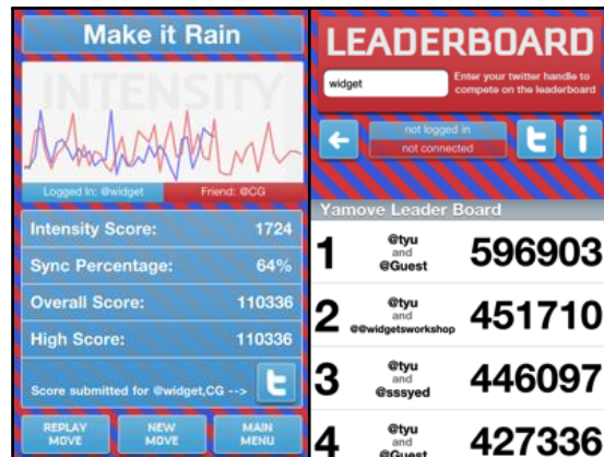
Figure 2. Further screenshots of the Yamove! 1.0 interface. When the round is over, players see the game results screen on the left, which includes their intensity score, sync percentage, overall score (i.e., the intensity score multiplied by the sync score), and a detailed graphic showing the intensity data for both players in different colors. The right image presents a leaderboard, reachable from the Main Menu, which gives a list of the top 10 all-time scores from any pair of players who has ever interacted with the game.