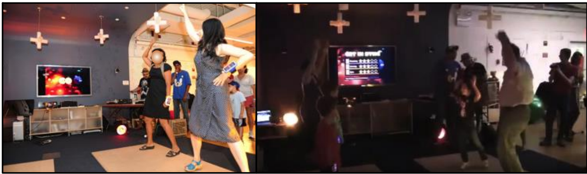
Figure 4. The 2.0 version of Yamove!, shown during the World Science Festival public exhibition. The dance space was demarcated by colored areas on the floor, and dance pairs faced one another in front of a large shared screen. The MC worked at a table to the right, selecting music and calling out instructions to players. The left figure shows how the dedicated mobiles were worn on the players' wrists, while the right figure shows a full dance battle with the teams facing off.

From a technology perspective, the game is no longer packaged as a pure mobile app. Instead the game is played using a combination of software. There is still a mobile app that each