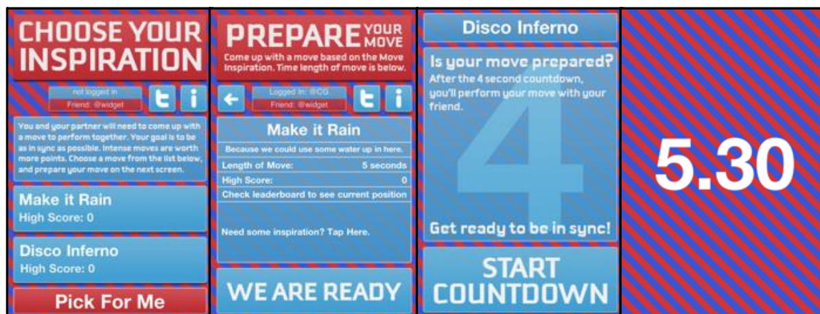
Figure 1. Screenshots of the steps taken to initiate play in Yamove! 1.0. Players first launch the app, then pair their devices. Next they select a movement prompt (Make it Rain or Disco Inferno—see first screenshot). Then they see more details about that movement prompt (second screenshot). If they have decided this is the movement prompt they want to use for improvisation, they click “We are ready.” At the next step, players click “Start countdown” to begin their movement session. The last screenshot shows the time clock running down while the players are moving together during the play round.

The initial research plan was to playtest this prototype and make refinements to the game, with the goal of conducting a public exhibition a few months later. The first public playtest was held at Eyebeam, an art and technology gallery in New York City. Thirteen people agreed to try the game 3 (see Figure 3). We made video recordings of these play sessions and players completed a brief Web-based survey about the game afterward. In addition to general questions about the gaming experience, this survey included questions aimed particularly at providing social support