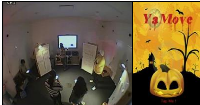
Figure 9. The Halloween playtest had some, but not enough, of the social atmosphere elements for successful engagement by potential game players.

Our next two playtests were at Parsons/The New School. The first was for a Game Club night; the second was for an open playtest for designers in a graduate program. For these tests, we had four devices ready so the play was not delayed for resetting between pairs. We also introduced a list where people could sign up for a round with a friend, which also allowed them to prepare for participating. The outcome from both tests was encouraging: Players engaged the game with enthusiasm and, at times, it was difficult to get them to stop dancing at the end of a round. Several players reported feeling more energized and positive after playing. We attributed the smoothness in the flow of these playtests to the decision to explain the game in advance and to encourage participants to sign up for slots, which framed the experience for them ahead of time and created a steady flow of dance teams.