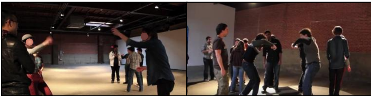
Figure 3. First playtest of Yamove! 1.0 at Eyebeam. Though players reported enjoying engaging in the joint performance, once they began and were able to synchronize improvised movements (see left image), the moves appeared somewhat socially awkward (see, for example, right image).

for gameplay. In their responses, players noted some usability issues with the game’s interface and some issues with the deployment of the game, especially in terms of setting up game sessions and in understanding scores. Overall, they reacted positively to the central activity—choreographing movements together. Video data provided evidence of laughter and engagement; survey responses included comments such as, “ We had fun moving together and sharing enthusiasm for the game. ” There were many suggestions for providing better social support within the game. For example, players suggested adding a location-based system that could alert a player when another potential player was nearby. They also suggested providing social rewards, such as a buddy pyramid system displaying the evolution of social connection with dancing partners. They also recommended adding public scoreboards that could be shared on platforms like Twitter and Facebook.