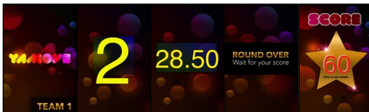
Figure 7. Screenshots of the mobile interface for the 2.0 version of Yamove! that the active player pair would see during a round. Left, the mobile’s screen indicates which team is currently active. The second left screenshot shows a quick countdown toward the beginning of the active team’s dance round. The center screenshot indicates the countdown of the seconds left in the active team’s round. The screenshot in the 2 nd to right position provides a play-in-progress screen that bridges the end of the round and the display of the calculated score for the active team. The right screenshot displays a simplified final score screen. The 60 is a rating from 1 to 100, derived from a weighted combination of the three scoring factors (see Figure 6 for those factors).

player launches, but the dance rounds are controlled with a moderator app driven by an iPad interface. There is also a Web-server-based display app used to drive what is shown on the large shared screen. The moderator app was implemented on an iPad for easier managing by the MC or another operator.